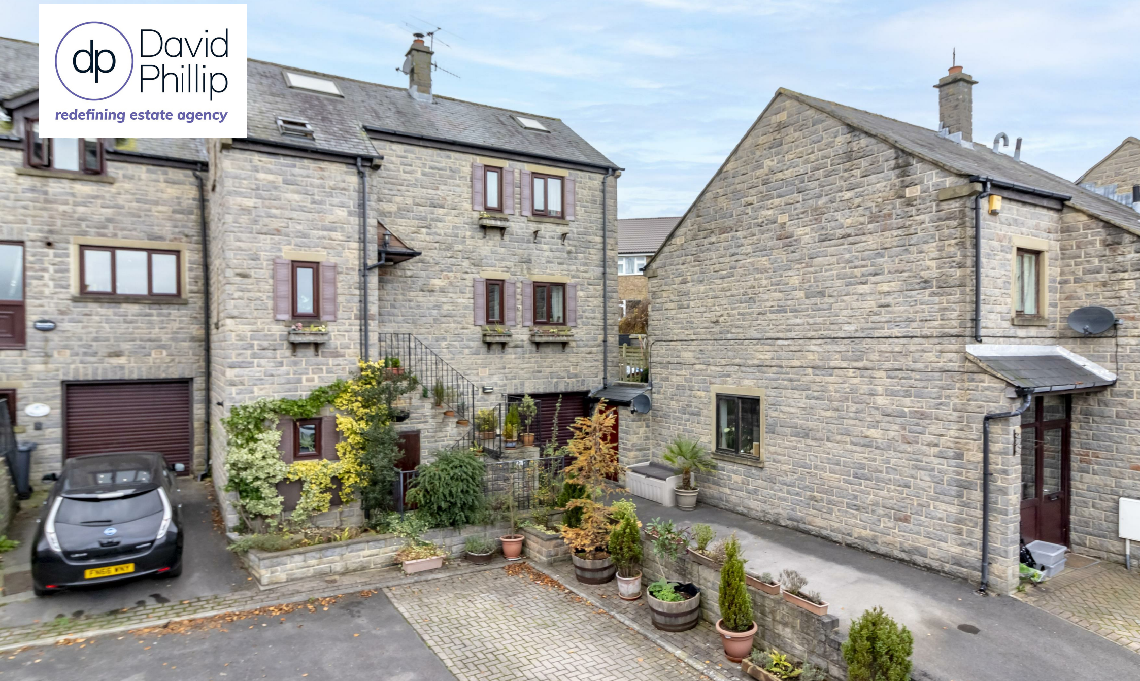
Plum Tree Cottage, 4 The Old Orchard, Pool In Wharfedale, LS21 1RY